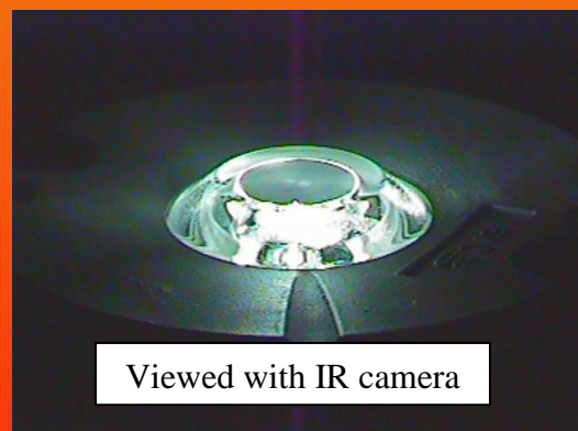
Viewed with IR camera